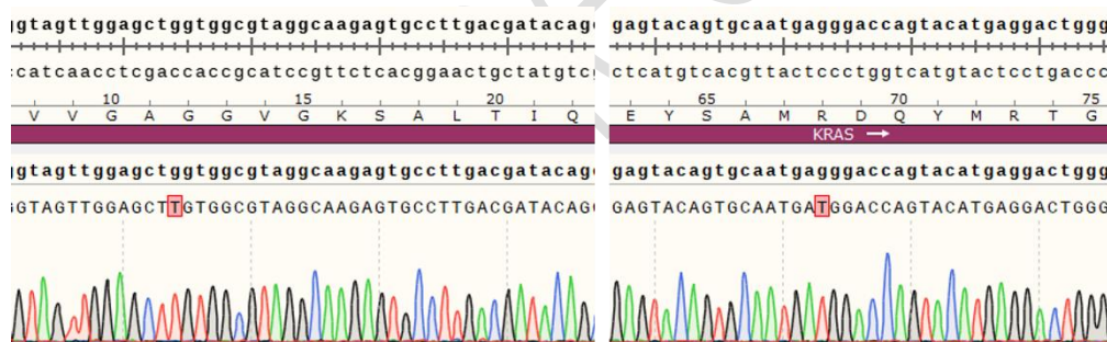
Figure 2 | The KRAS mutation analysis by Sanger sequencing.